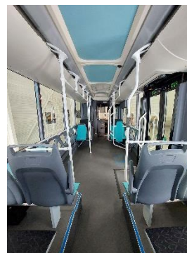
Layout 12 m: 3 doors